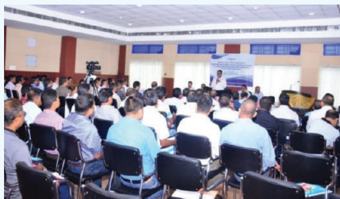
Picture shows Presentation of Key Note Address by Shri Shyam Jaganathan, IAS, Commissioner & Secretary to Govt of Assam, AHVD in the Inaugural session of the Conference